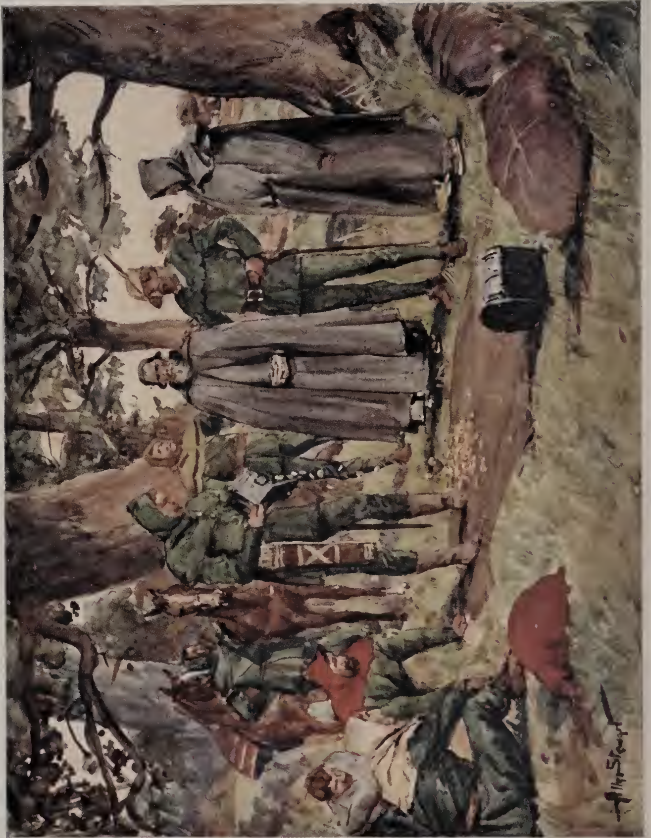
THE OUTLAWS COUNTED THE BOOTY.